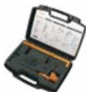
LION-VTC-DRILL P. 165